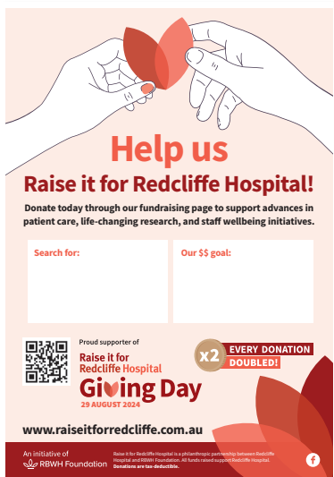
Poster to use

Options to print poster or add your details to template in Canva.