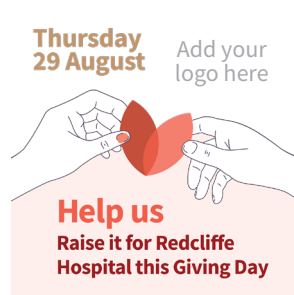
Social template in Canva.

Add your logo. Go to https://bit.ly/3Kbdaqp