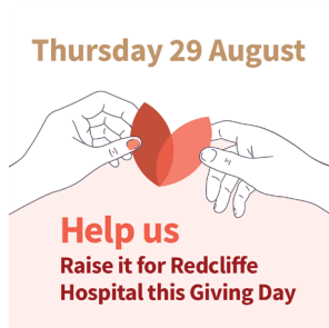
Graphic to use

Graphics to use in your company or personal social media feed. Use graphics supplied or add your details to template in Canva.