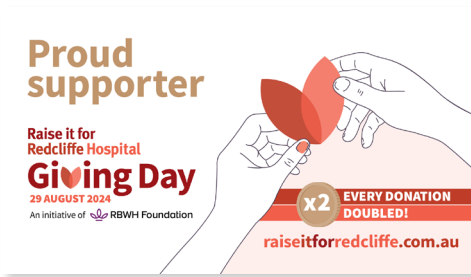
Graphic to use

Graphics to load to internal screens. Use graphics supplied or add your details to template in Canva