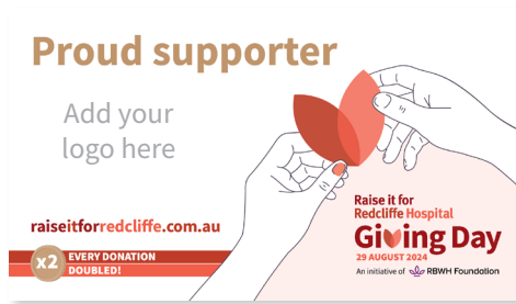
Screen template in Canva.

Add your logo, name and fundraising goal.