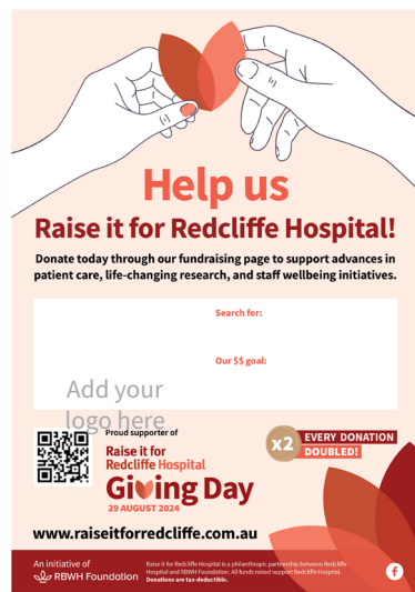
Poster template in Canva.

Add your logo, name and fundraising goal.